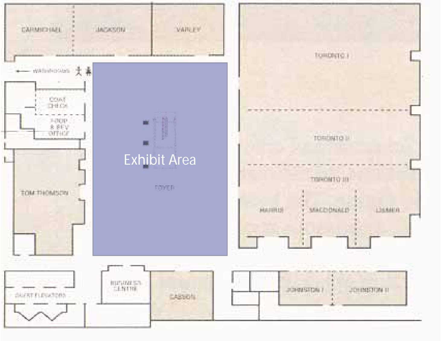
Exhibit Floor Plan